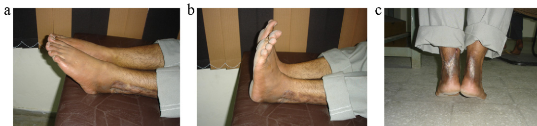
Fig. 3. Showing postop clinical outcome – plantar flexion (a), dorsiflexion (b) and standing on tiptoes (c). Note healed skin flaps.

without either proximal releases or autograft augmentation, and then rehabilitation has to be somewhat modified.