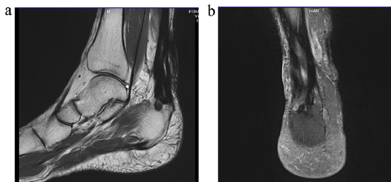
Fig. 2. Postop MRI – T1-weighted sagittal and coronal cuts showing good bio-integration of LARS ligament.

Tendo-Achilles tears are problem scenarios at the best of times. Most often they occur through a degenerated tendon [15], or with some underlying cause that has weakened the tissue. Multiple solutions have been advocated for a primary reconstruction, with or without augmentation. The problem becomes compounded when the case is bilateral, as postoperative ambulation is often an issue. A period of neglect, as was seen in our case, further adds to the difficulty, as the retracted tendon ends cannot be brought together